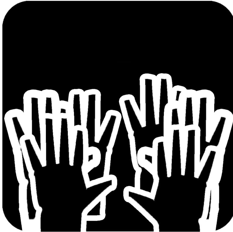
Figure 1. The icon for the TK Outreach License.

By describing and defining the rights and expectations of both the TK holders and users, we hope to highlight the reciprocal nature of any and all uses of these materials. That is, we are aiming to promote a conversation that extends beyond the creation of a license in order to help foster meaningful dialogue and negotiations between various stakeholders who have historically not been in dialogue. 6 Where IP laws and regulations can be very complicated and confusing, we aim for the process of generating the TK Licenses and Labels to be both straightforward and sensible.